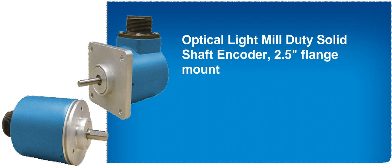
Optical Light Mill Duty Solid Shaft Encoder, 2.5" flange mount